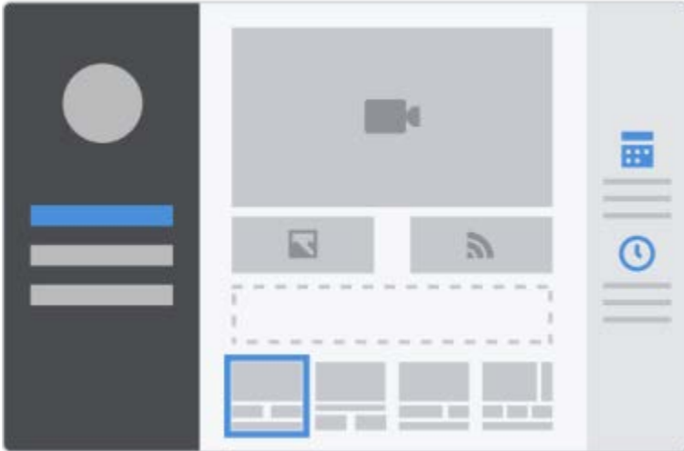
Design & Scheduling PLAYER MANAGER