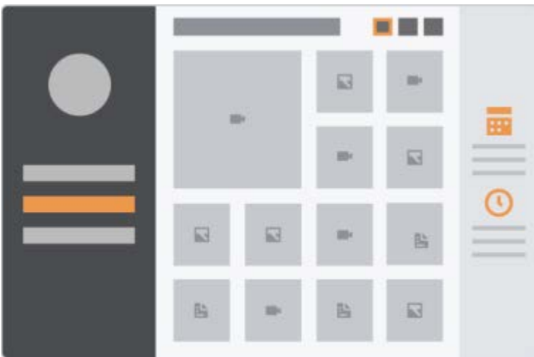
Content Management CONTENT MANAGER